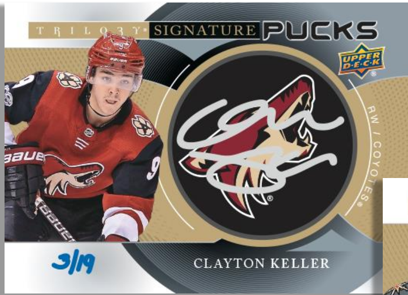
Signature Pucks Team Logo Parallel [#'d to 19]