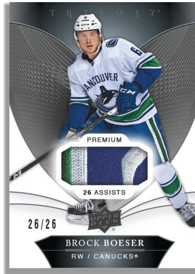
Black Premium Materials Relic Base Parallel [#'d to Player's season stats]