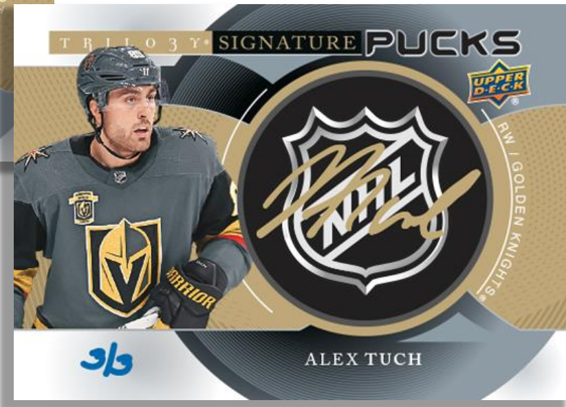
Signature Pucks NHL Logo Parallel [#'d to 3]